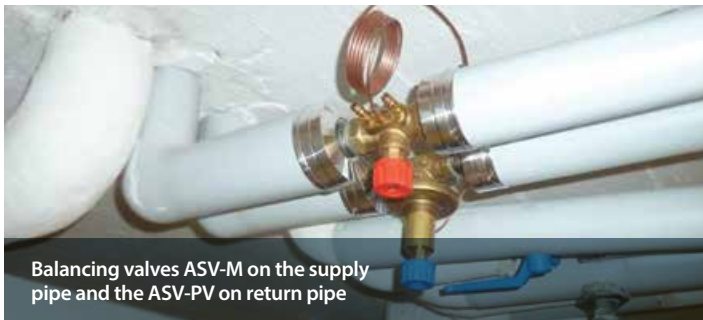
Balancing valves ASV-M on the supply pipe and the ASV-PV on return pipe

Apart from the energy savings, the housing association was pleased to be able to provide an improved indoor comfort to the residents. Since the completion of commissioning of the valves, no complaints from the residents have been received.